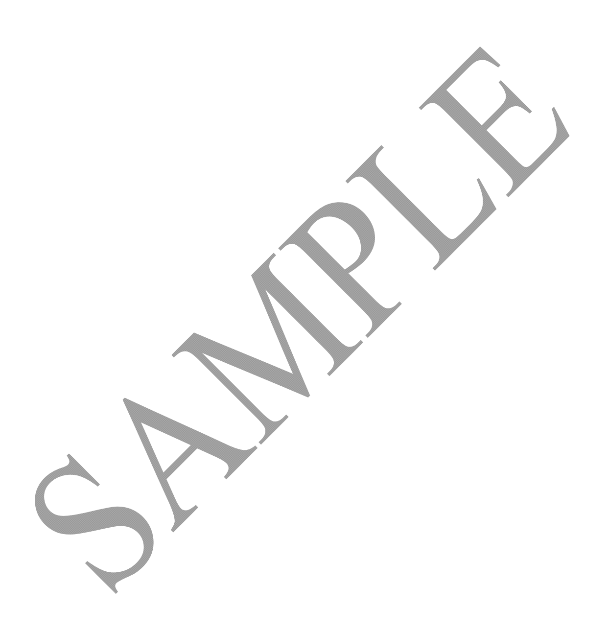
EXHIBIT "A" LEGAL DESCRIPTION